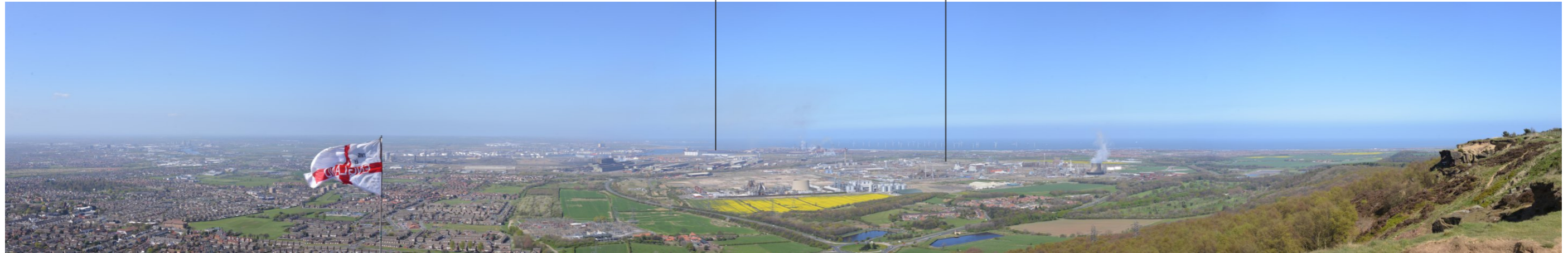
VIEW 19. Looking north from Eston Nab (southern rock outcrop)