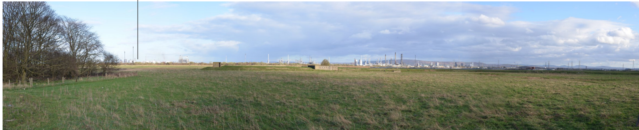
VIEW 20. Looking east from A178 near Greatham Creek (and near Teesmouth National Nature Reserve visitor car park)