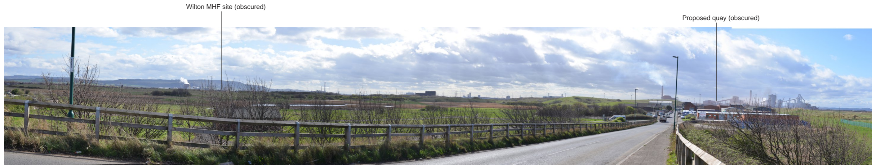
VIEW 5. Looking west from Teesdale Way near Warrenby

Note: lines on photographs indicate approximate horizontal extent of scheme within view but do not illustrate conveyor height.