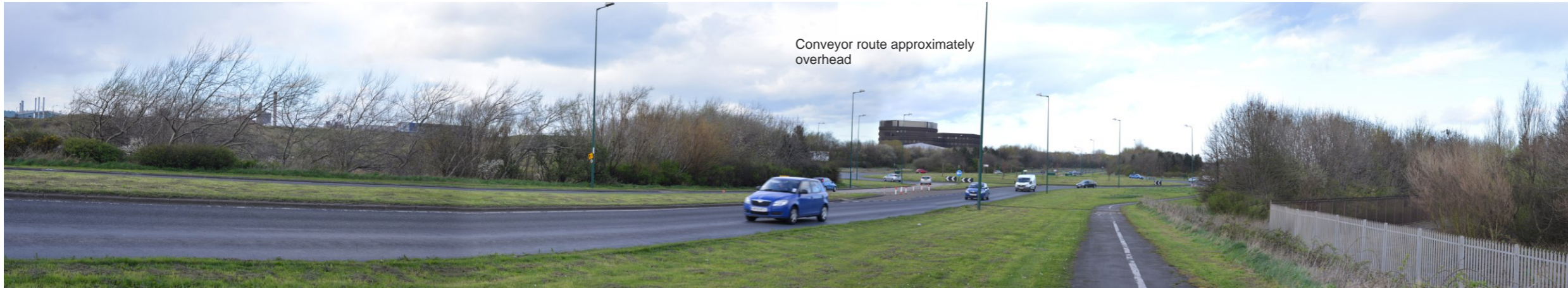
VIEW 11. Looking north east along A1085 from southern cycleway (north of Lord McGowan Bridge)