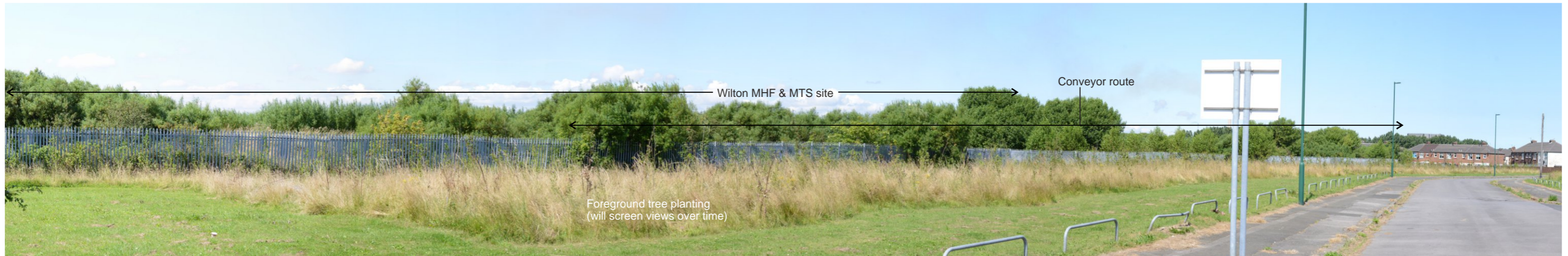
VIEW 23. Looking north west from Hobson Avenue (Dormanstown)