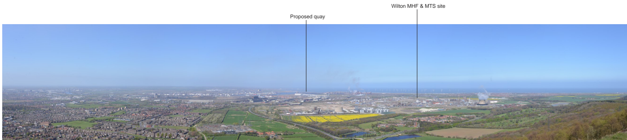
VIEW 18. Looking north from Eston Nab (northern rock outcrop)