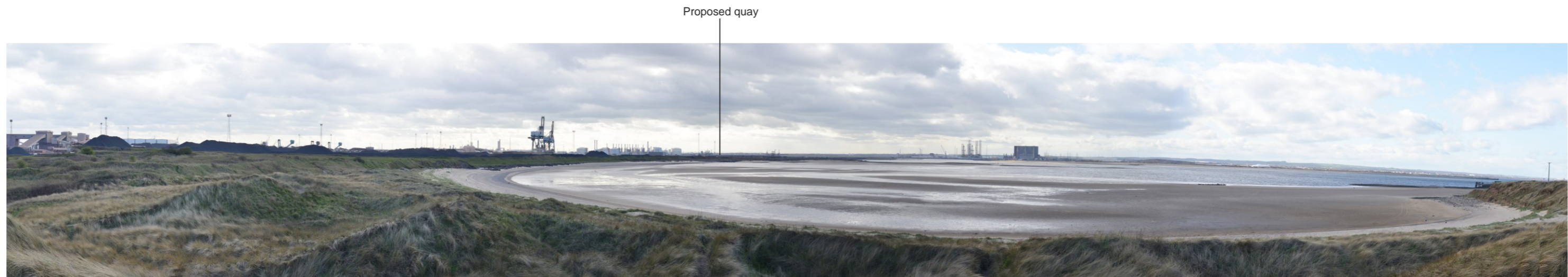
VIEW 4. Looking south west from dunes at South Gare Breakwater across Bran Sands