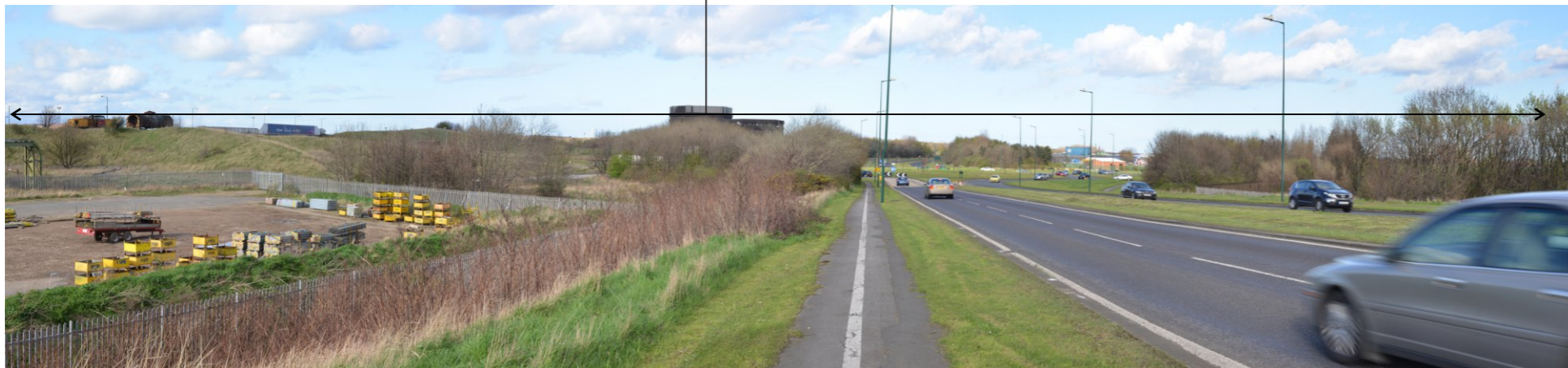
VIEW 12. Looking north east along A1085 from northern cycleway (north of Lord McGowan Bridge)