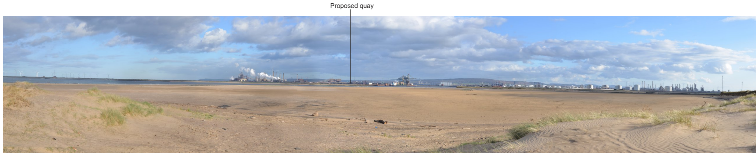
VIEW 1. Looking south east from North Gare Sands (Teessmouth National Nature Reserve)