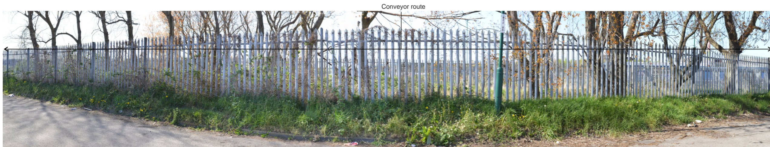
VIEW 8. Looking west from rear of Broadway West (Dormanstown)