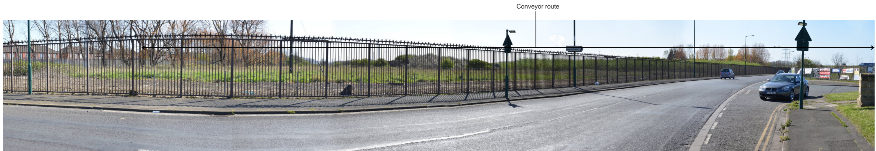
VIEW 7. Looking south from West Coatham Lane