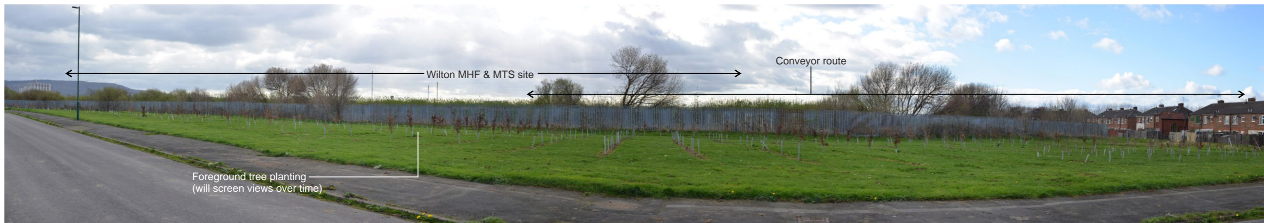
VIEW 9. Looking west from public open space off Hobson Avenue (Dormanstown)