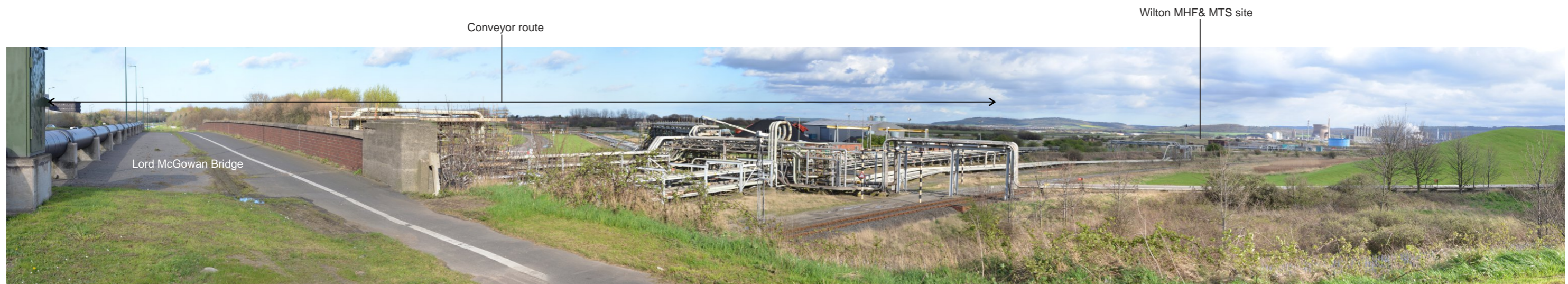
VIEW 14. Looking south east from southern cycleway on A1085 at Lord McGowan Bridge