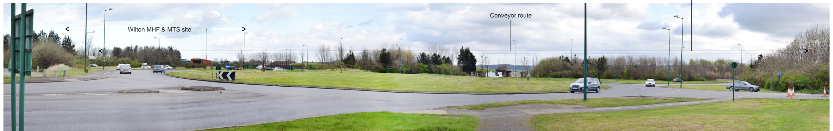
VIEW 6. Looking south west from A1085

Note: lines on photographs indicate approximate horizontal extent of scheme within view but do not illustrate conveyor height.