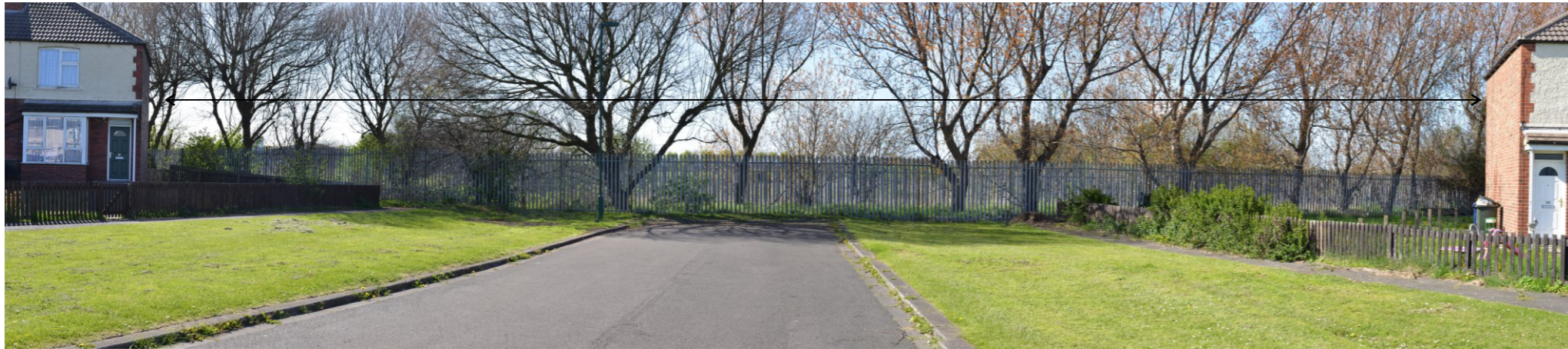
VIEW 10. Looking north west from Wilton Avenue (Dormanstown)