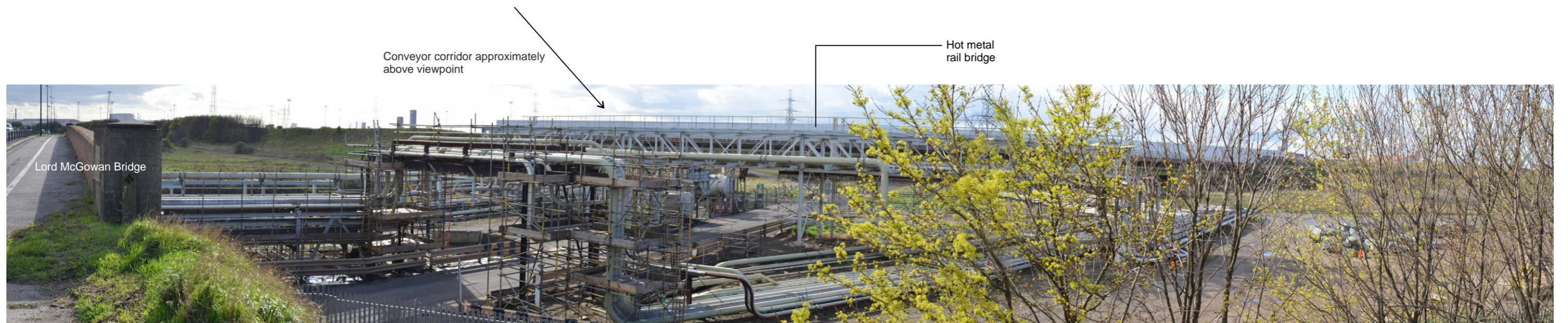
VIEW 13. Looking west from northern cycleway on A1085 at Lord McGowan Bridge