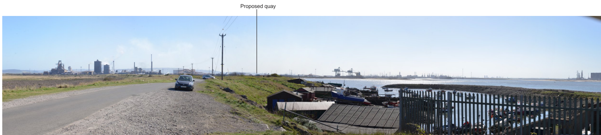
VIEW 2. Looking south from Teesdale Way across Paddy's Hole Marina