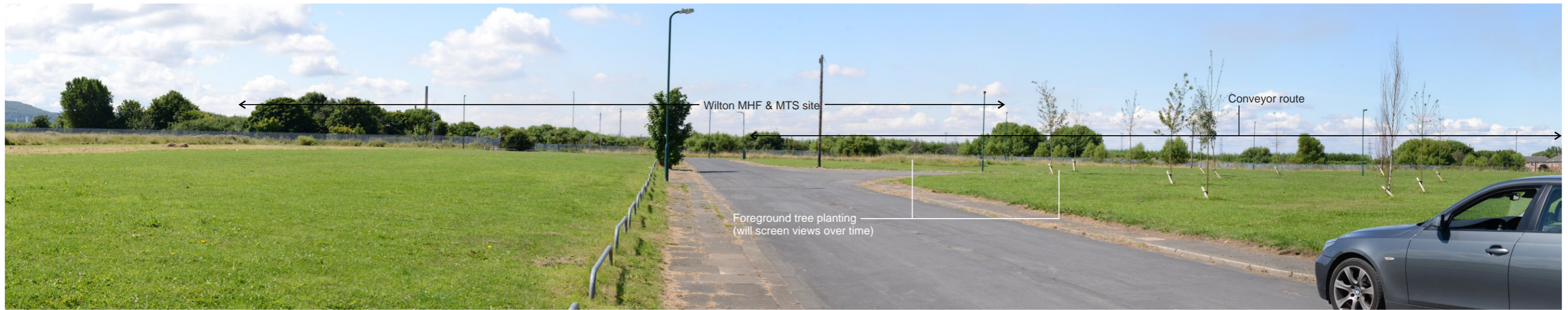
VIEW 22. Looking west from Hutton Grove (Dormanstown)