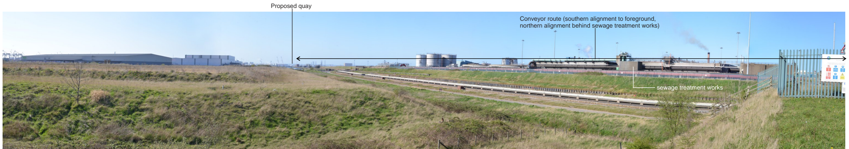
VIEW 17. Looking north and west from near footpath 116/31/2