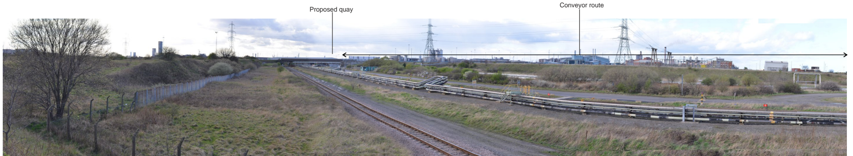
VIEW 16. Looking north and west from near bridleway 116/9/2 (Teesdale Way)