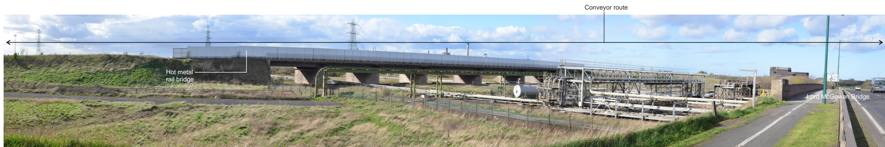
VIEW 15. Looking north from northern cycleway on A1085 at Lord McGowan Bridge